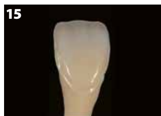
Fig. 15: Lustre Pastes ONE – coloring and wash fire