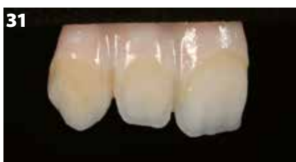
Fig. 31: Initial Lustre Pastes ONE after firing