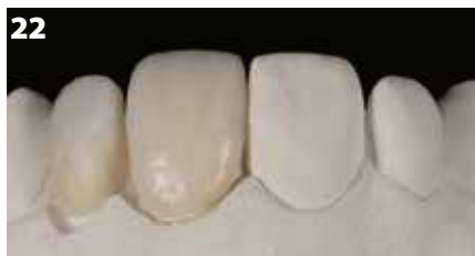
Fig. 22: SQIN micro-ceramic layer before firing