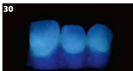
Fig. 30: Fluorescence of the white areas, non-fluorescence of the red areas