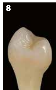
Fig. 8: After: Finished crown