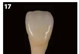
Fig. 17: Result after firing