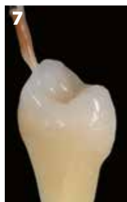
Fig. 7: Application of Lustre Pastes ONE