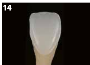
Fig. 14: Zr crown, 0.3 mm labial reduction

With the new micro-layering concept - Initial IQ ONE SQIN - a very thin ceramic layer (approx. 0.2-0.3 mm) is applied on the surfaces that have been previously fired with Lustre Pastes ONE. The end-result is achieved in just one firing. This is made possible thanks to the newly developed feldspar-based SQIN ceramic powders. Using the special mixing liquid (Form & Texture Liquid) the application is very comfortable – easy to form your final shape, easy to mimic texture. After the final, shiny firing result – the so called –“self-glazing effect” is obtained. Due to its high homogeneity, the mass remains very stable during processing and shows hardly any shrinkage after firing, so that shape and texture no longer need to be corrected (Figs. 14-17).