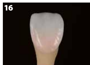
Fig. 16: Micro-ceramic layering with Initial SQIN