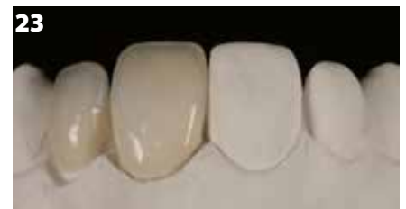
Fig. 23: Firing result with "self-glaze" effect of SQIN.