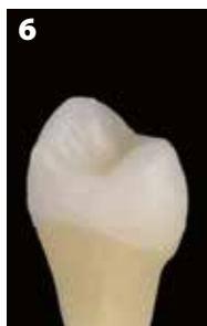
Fig. 6: Before: Zr crown

Lustre Pastes ONE can also be combined with Initial Spectrum Stains (fine ceramic stains), thus offering unlimited color options.