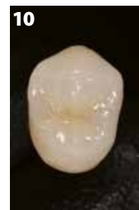
Fig. 10: After: Finished crown