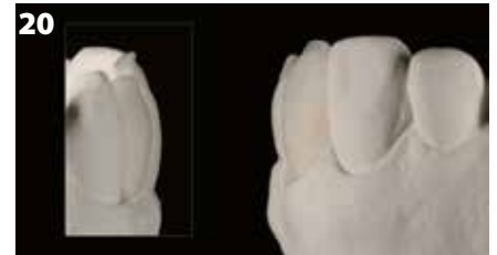
Fig. 18-20: Initial LiSi Press (LT-B0) veneers with minimal labial reduction