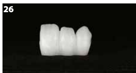
Fig. 26: Zirconia structure

Especially in implantology, we often come across the situation of reconstructing gingiva with our prosthetic superstructures. The red-white gradient deserves special attention. Here, too, the technology of Initial IQ ONE SQIN concept is used. The different gingival regions can be reproduced with three different SQIN gingival powders. A more intense red for areas with strong blood circulation and a lighter shade for the firm gingiva are essential. Furthermore, a neutral type completes the line-up. In contrary to the tooth-shaded SQIN powders, all SQIN gingival powders are inherently non-fluorescent (Fig. 30). The way it works is the same as with tooth-colored ceramics. First, Lustre Pastes ONE and/or Lustre Pastes NF Gum shades are applied to give an ideal color base and create a good bond with the ceramic layer (connection firing). Then SQIN gingiva- and tooth-colored ceramic is applied in a final firing.