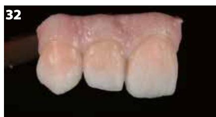
Fig. 32: Red and white SQIN ceramics before firing (shaping & texture possibilities!)