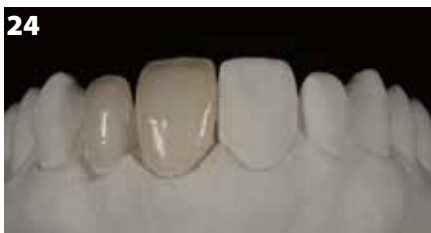
Fig. 24: External glaze firing with Initial Spectrum Stains