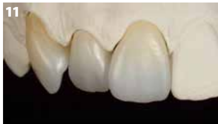
Fig. 11: Sintered Zr crowns after firing

The corresponding tooth areas are color-coded for more individuality. The three-dimensional effect of the pastes creates a dynamic result (Figs. 11-12).