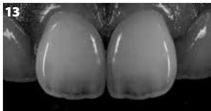
Fig. 13: Grayscale image of natural teeth showing the variance in color value throughout the teeth, especially in the incisal third.

Natural teeth can sometimes have a very complex depth and individuality in their enamel layers (Fig. 13).