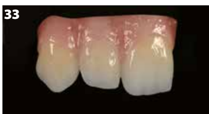
Fig. 33: Result after firing