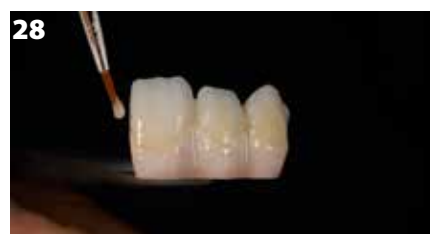
Fig. 27-29: Zirconia structure, application of different tooth-colored (Initial Lustre Pastes ONE) and gingiva-colored pastes (Initial Lustre Pastes NF Gum)