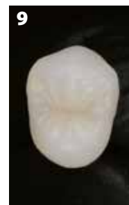
Fig. 9: Before: Zr crown