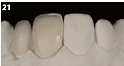
Fig. 21: Lustre Pastes ONE